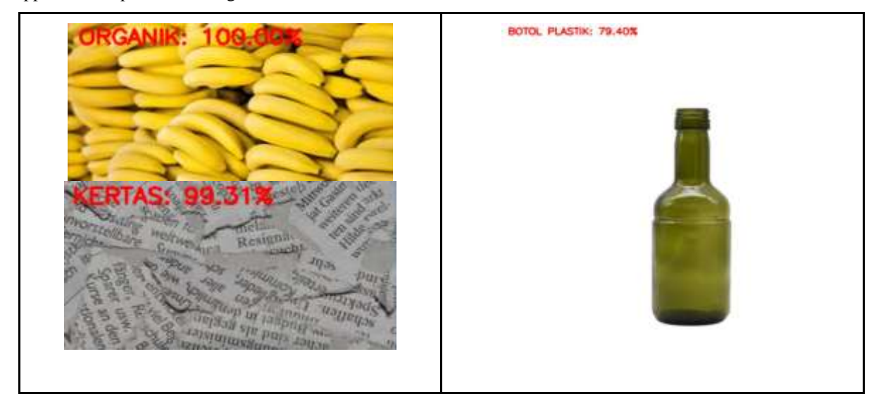
Figure 4. Testing the model

The model is deployed in an android mobile application called "DjunkGo" to predict the class of the trash image given by the user. After successfully predicting the image, the user may save it to the list. Then, they may sort the trash and give it to the waste collector. Here we try to test our application using the testing dataset. The result shows the application can predict the image correctly (Figure 4). The design of this application is provided in Figure 5